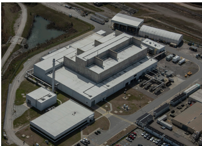
SWPF will process the majority of the Site’s salt solution waste.

Removing salt waste, which makes up approximately 92 percent of the waste volume in the SRS tank farms, is a major step toward emptying and closing the Site’s remaining 43 high-level waste tanks that contain approximately 34.5 million gallons of waste.